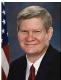
Senate Committee Chairman Tim Johnson (D-SD)

The Senate Committee on Banking, Housing, and Urban Affairs set a public goal of marking-up a bill on housing finance reform by the end of 2013. Unfortunately, despite holding 10 hearings over the last six months on different elements of the reform process, it does not appear that the committee will be able to meet its goal. Chairman Tim Johnson (D-S.D.) has