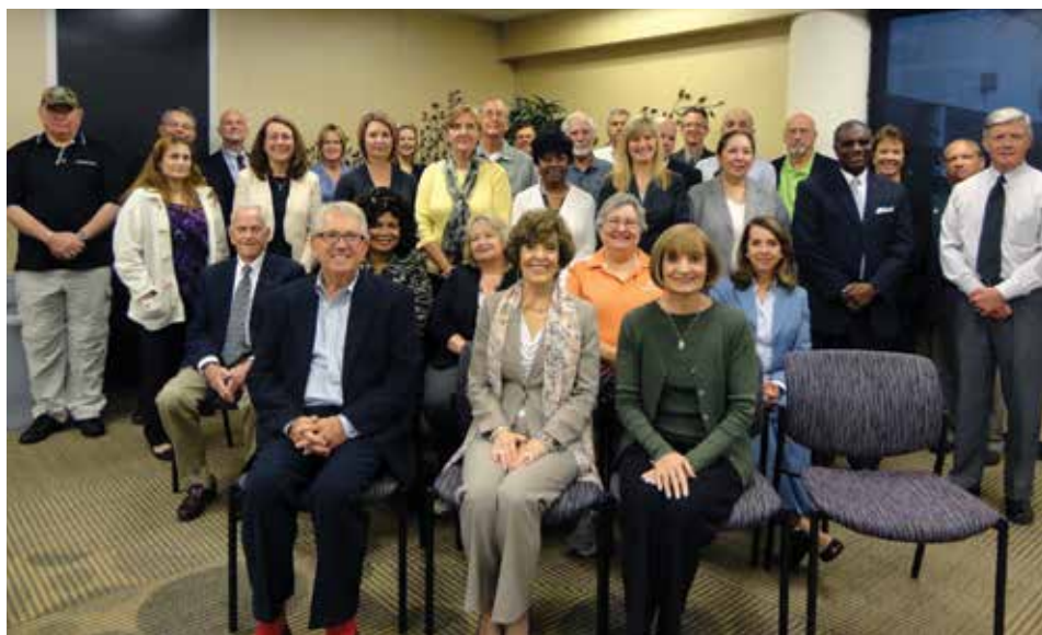
NASCUS' Florida Directors College attendees gather for a group photo at Suncoast Schools Federal Credit Union in Tampa, Fla.